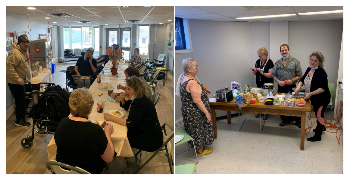
The HAGI community enjoyed an Easter brunch together.